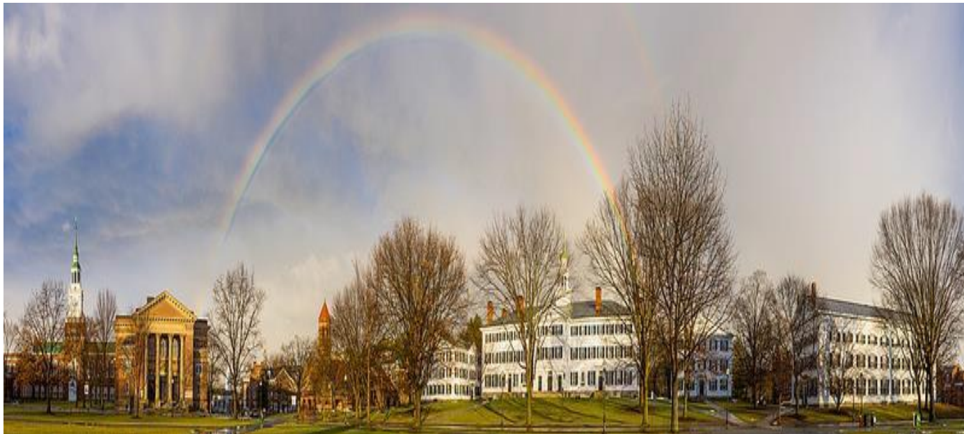
Double Rainbow Over Dartmouth College Summer 2013

The benefits described in this document are effective with the plan year beginning on September 1, 2021.