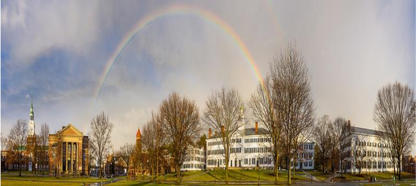
Double Rainbow Over Dartmouth College Summer 2013

The benefits described in this document are effective with the plan year beginning on September 1, 2020.